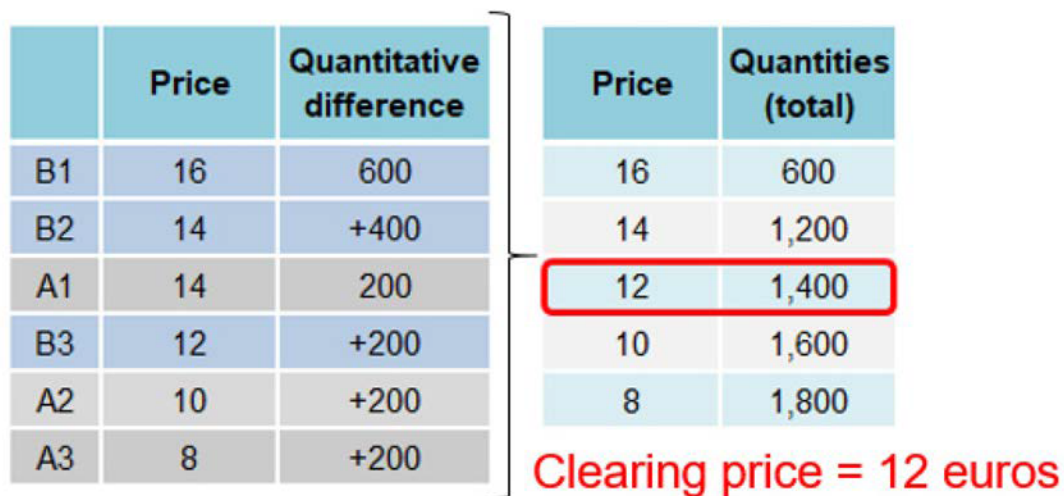
Figure 5: Price-quantity pairs for participants A and B, added together (right)

The price-quantity pairs are added together in descending order until they reach the quantity of emission allowances being offered for auction, or exceed it for the first time (see Figure 5).